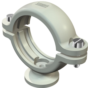
ISO base clip 50.5–54 mm